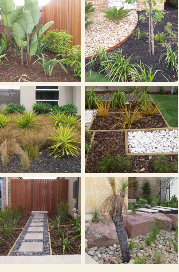
Encouraged landscaping solution