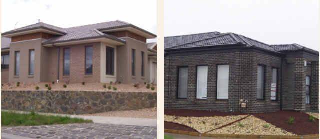
examples of acceptable corner treatment